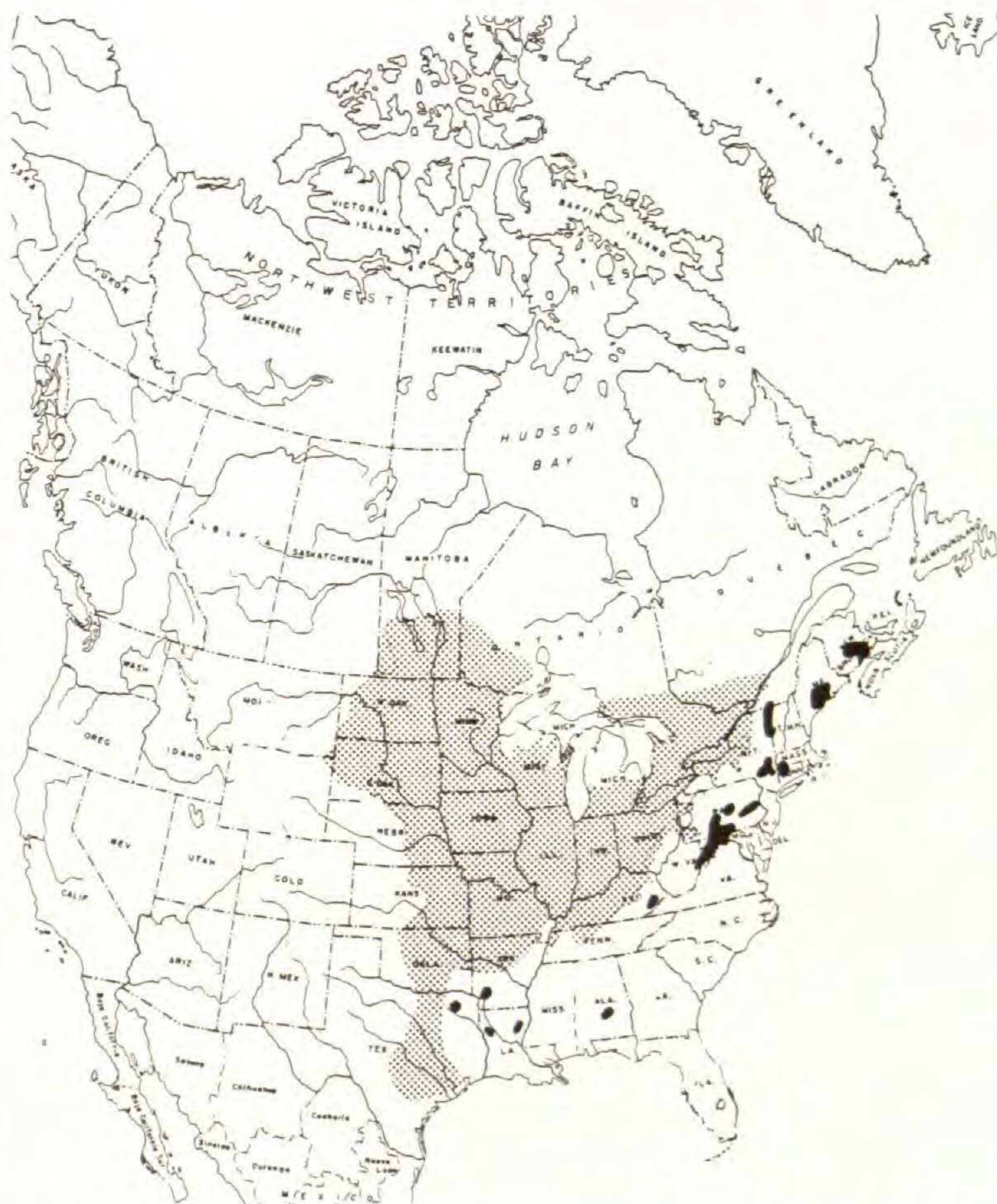
Figure 2. Southern-Midwestern element: distribution of Quercus macrocarpa (after Little, 1971).

A sub-group of the Eastern Deciduous Forest element has, from the point of view of the Berkshire County Flora, a distinctly southern and midwestern center (Figure 2). Most of these species are among the more uncommon or rare plants of the county as they are at or near the northeastern limits of their ranges, and most are found in the southern half of the county. Among these species are Quercus macrocarpa , Q. muhlenbergii , Staphylea trifolia , Zanthoxylum americanum , Ilex montana , Solidago speciosa , Andropogon gerardii , Sorghastrum nutans and Chamaelirium luteum .